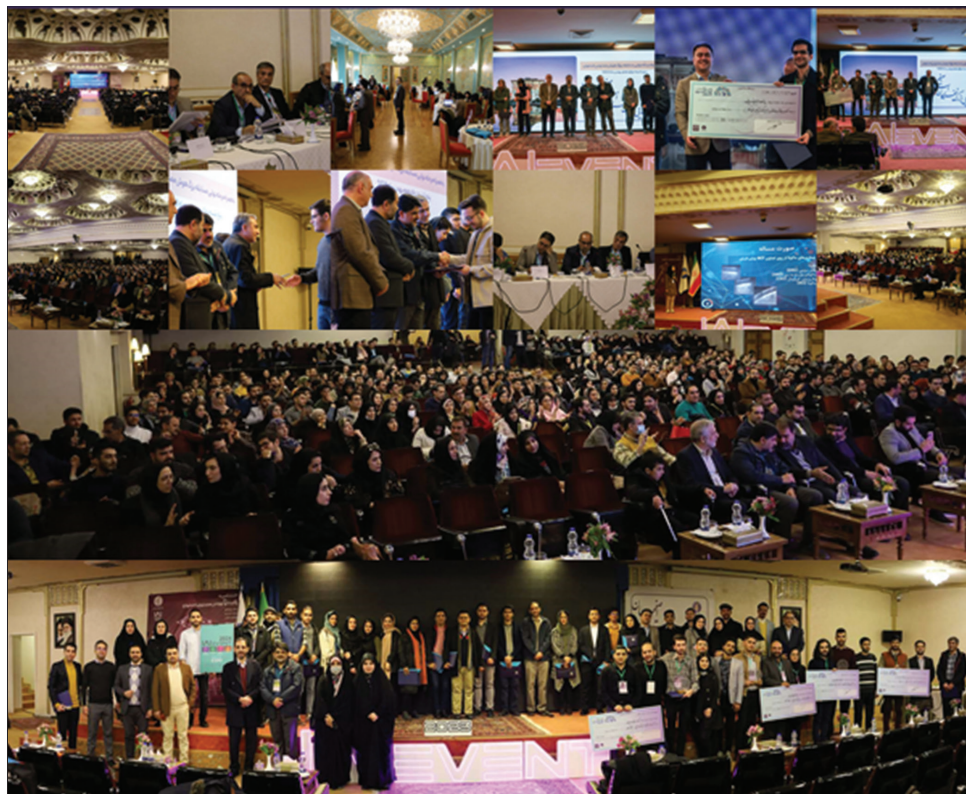
Figure 4: Several photos from the closing ceremony of Isfahan Artificial Intelligence 2023 competitions