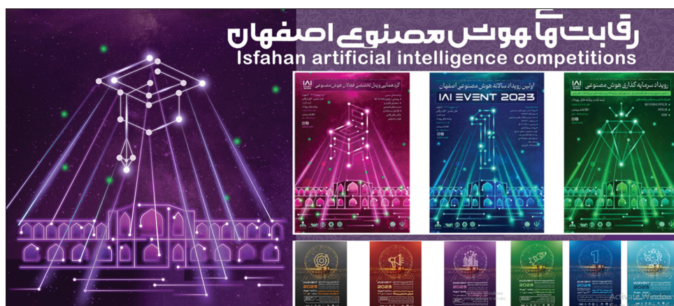
Figure 1: Posters of several events in Isfahan Artificial Intelligence 2023

exhibition, AI Forum, AI Investment Event, AI Student Meeting, and AI Competitions were the 5 main parts of this event in 2023 [Figure 1] and the Isfahan Elite Foundation was the main organizer of IAI 2023.