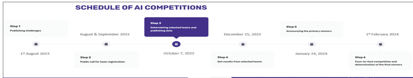
Figure 3: Timeline of Isfahan Artificial Intelligence 2023 competitions

The goal of IAI competitions was to take a step toward further developing AI-based technologies for real-world problems,